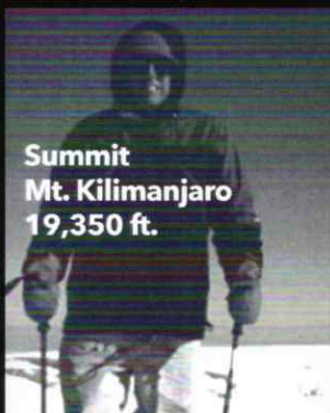
Summit Mt. Kilimanjaro 19,350 ft.